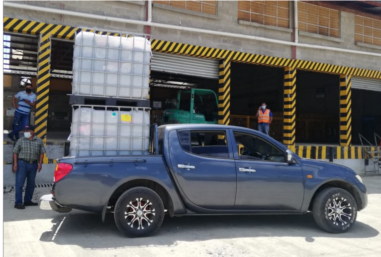
The shipment was picked up at a warehouse in San Pedro Sula, inland from Puerto Cortés.

These computers were the first sent by CPI to Honduras as freight; previously, all others had been carried in their luggage by visitors, most of whom were members of CPI's Learning Tours.